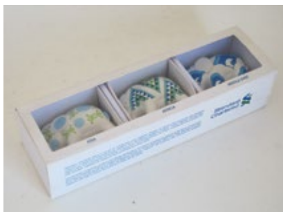
Above: Standard & Chartered 3 Pack - Asia, Africa and Middle East in 7cm replicas