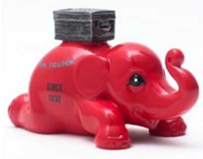
Right: Tin Trunk - 10cm Elephant Parade Replica

TANGS is the oldest home-bred department store in Singapore and a leading player in the retail industry.