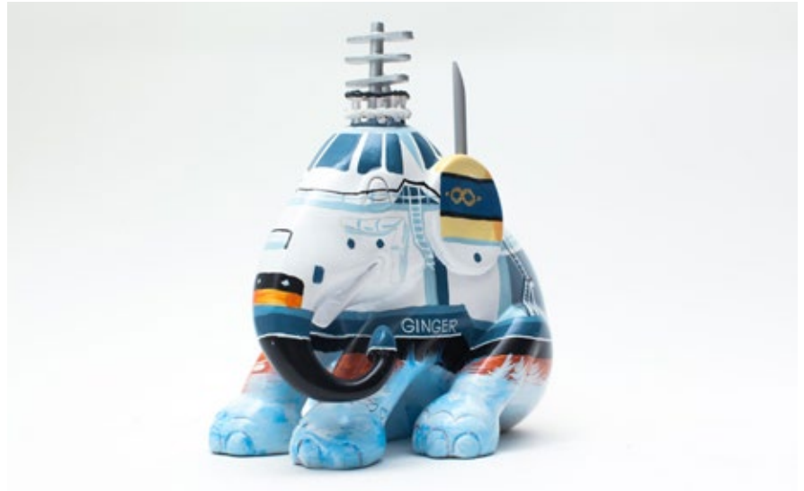
Right: 'Ginger & Brent' Tugboat - 15cm Elephant Parade Replica

Iskes Towage & Salvage is a Dutch company with a long history in professional towage. Founded in 1928, Iskes was a sponsor of Elephant Parade Antwerp 2008.