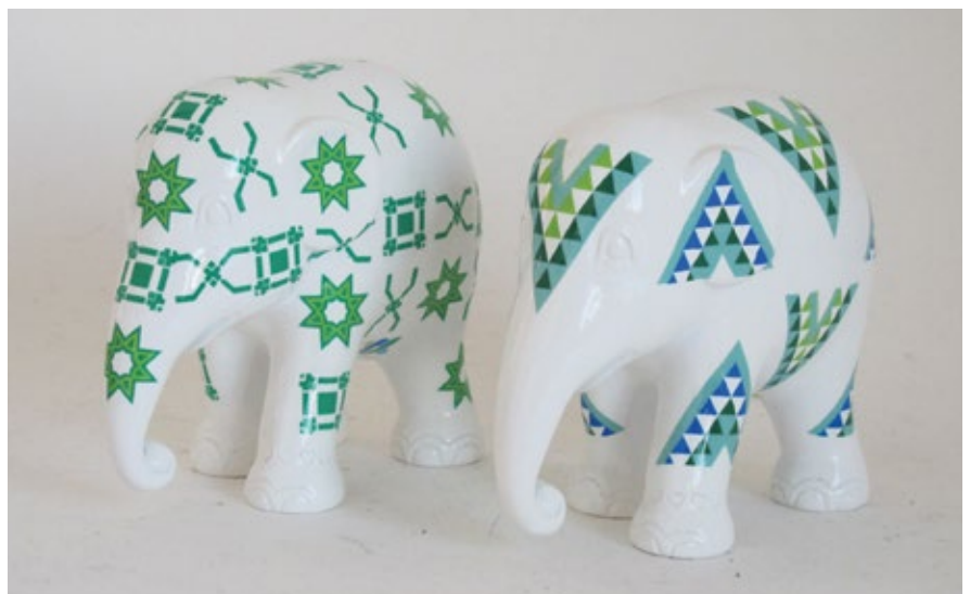
Right: Standard & Chartered 15cm Elephant Parade Replicas in Africa and Middle East styles

This Elephant Parade multi-pack was developed as a give away for the Standard & Chartered annual meetings worldwide. The design concept was based on their logo with inspiration taken from the different continents where Standard & Chartered operate.