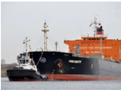
Above: Iskes Tugboats