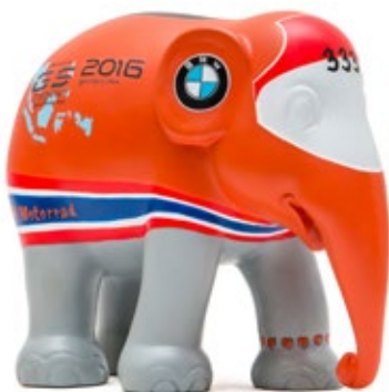
Above: CanCan 15cm Elephant Parade replica